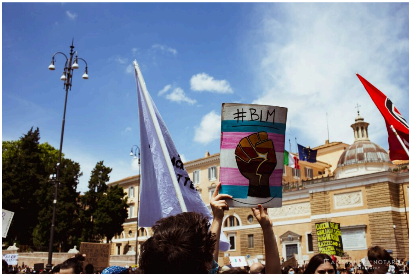
Black Lives Matter protest in Rome, 2020.