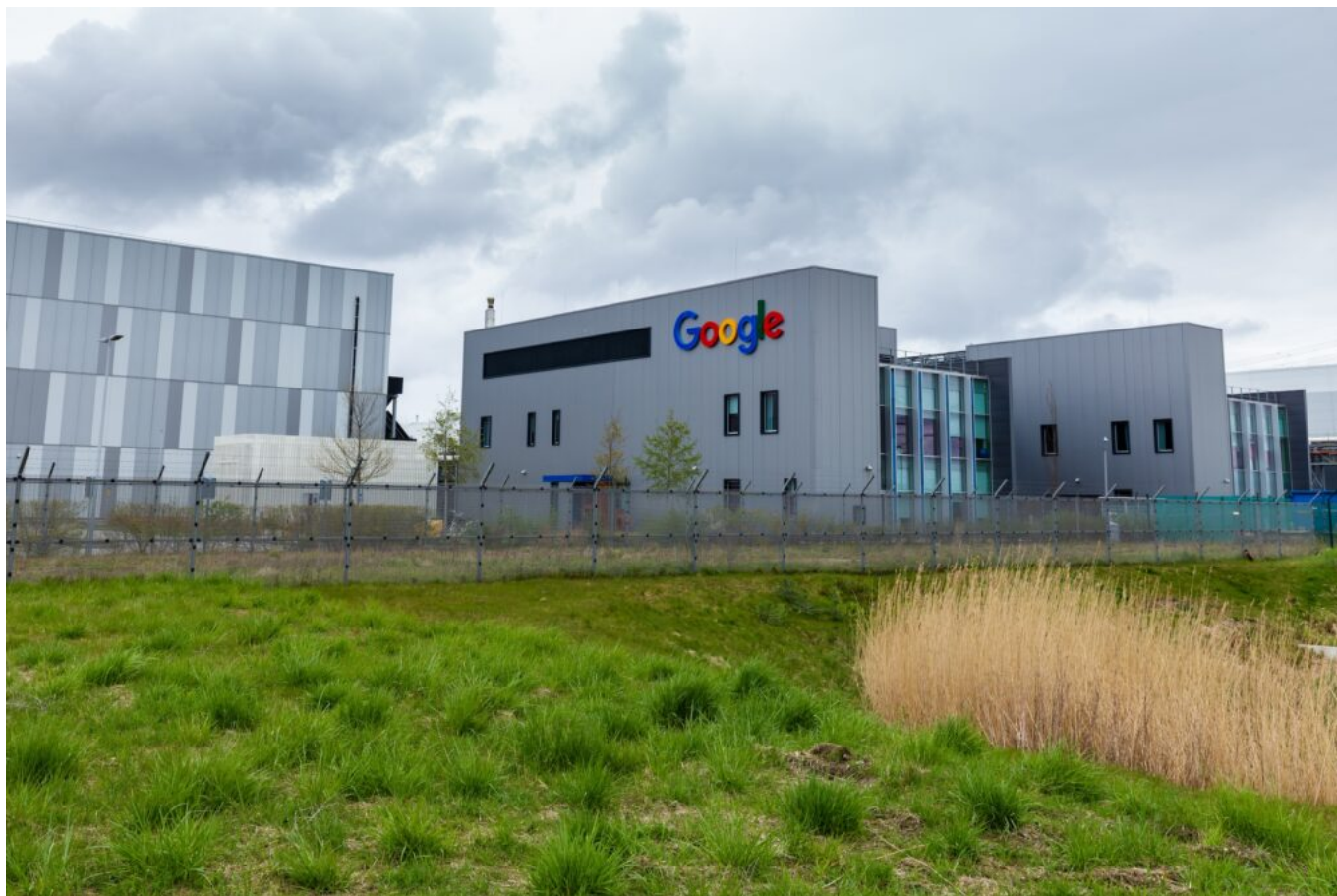
Large Google data center in the Netherlands.