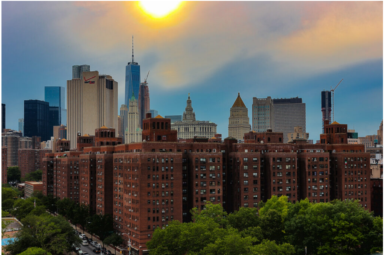
Knickerbocker Village in Manhattan’s Lower East Side.

have not been. In 2013, the 1,600-unit, 12-building Knickerbocker Village affordable housing apartment complex in Manhattan’s Lower East Side, also installed facial and motion recognition technology made by FST21. Knickerbocker Village is home to 4,000 residents as well as the Hamilton Madison House/Knickerbocker Village Senior Service Naturally Occurring Retirement Community, and its residents are largely Asian American immigrants. While they haven’t been able to remove the invasive technology, they have advocated for its removal given similar concerns. Other buildings such as Morris Avenue Apartments in the Bronx, Taino Towers in Harlem, and more have similar landlord technologies installed, much to the chagrin of tenants who are rarely, if ever, given the option to consent.